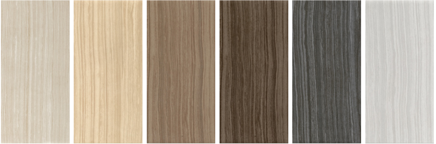
Vein A - A